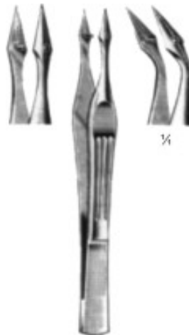
Walter Splinter forceps, 4-1/4" 58-719 Straight 58-720 Curved