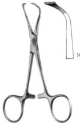
Lorna Towel Clamps Non-Penetrating 60-232 4" 60-233 5-1/4"