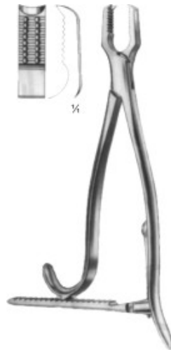
Kern Bone Holding 6", with ratchet 69-756