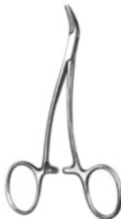
Peet Splinter forceps, 4-3/4" 58-732