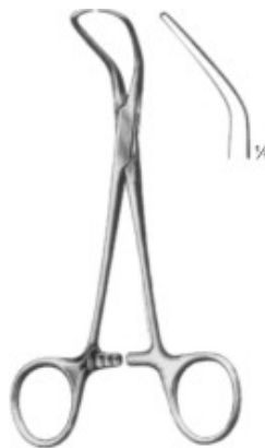
Backhaus Towel Clamps 60-229 3-1/2" 60-230 5-1/4"