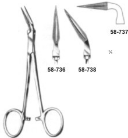
Williams Splinter forceps, 5-1/2" 58-736 Straight 58-737 45° angle 58-738 90° angle