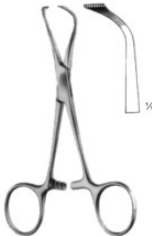
Lorna Towel Clamps Non-Penetrating 60-232 4" 60-233 5-1/4"