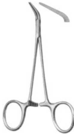
Halstead Mosquito, 5" 59-188 Angled jaws