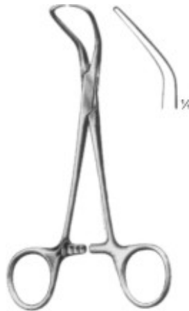
Backhaus Towel Clamps 60-229 3-1/2" 60-230 5-1/4"