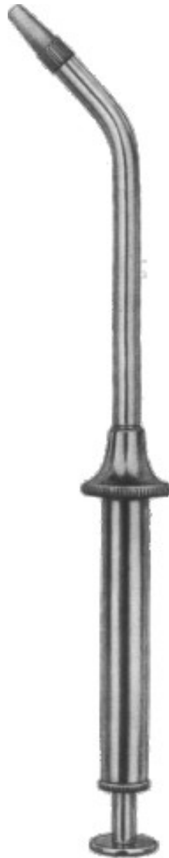
Fig. 2 80-831