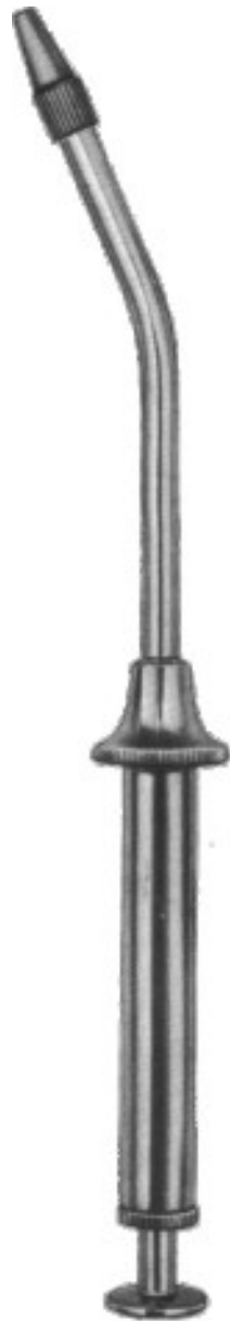
Fig. 1 80-830