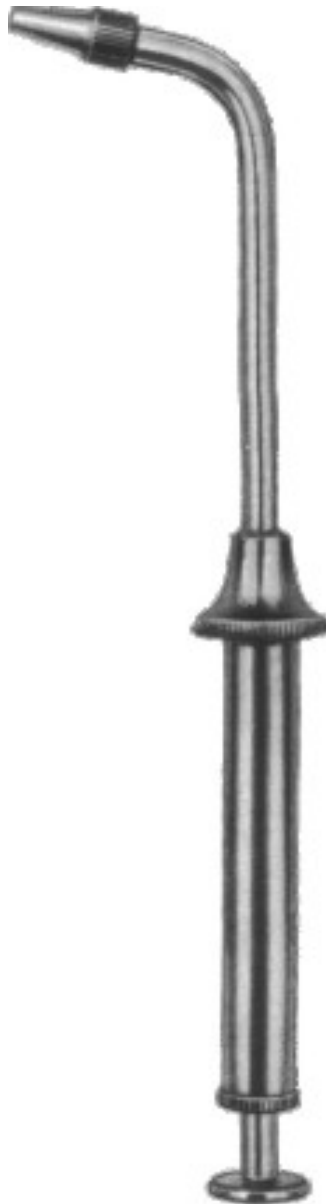
Fig. 3 80-832